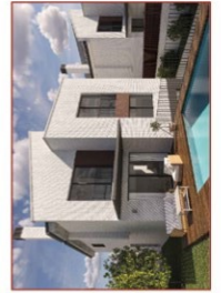
Residencial Can Nolla Vilassar de Dalt